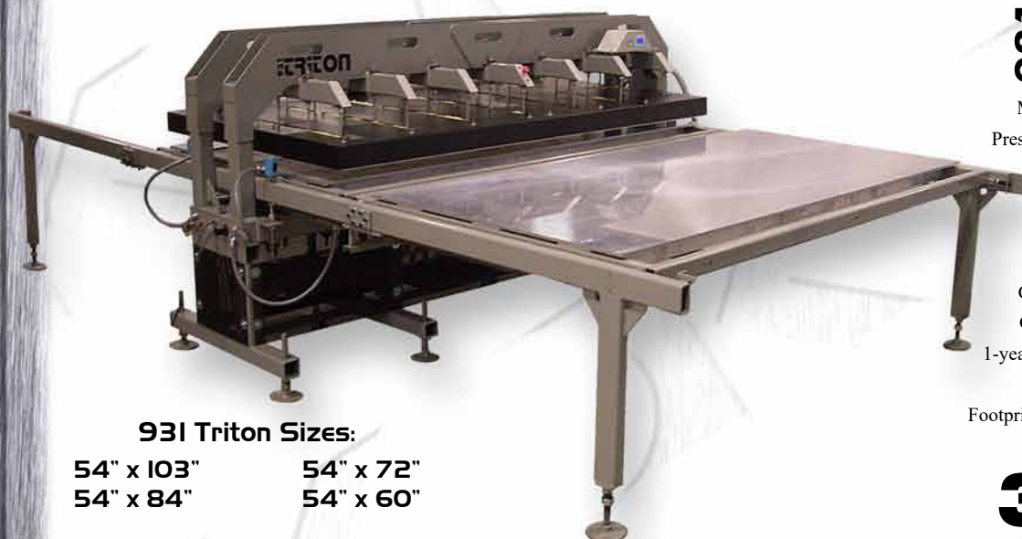
931 Triton Sizes:

54" x 103" 54" x 72" 54" x 84" 54" x 60"