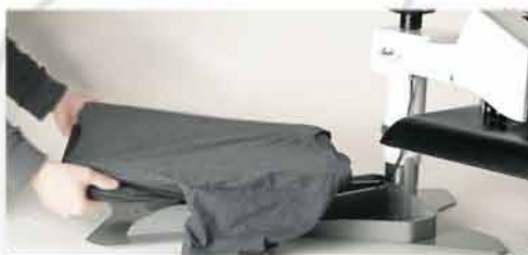
Dress / Thread from the back (Shirts right-side up!)

Our exclusive SuperCoil-Microwinding™ heater technology guarantees perfect uniform heat to the edge - outperforming and out heating all others, with Lifetime Warranty!