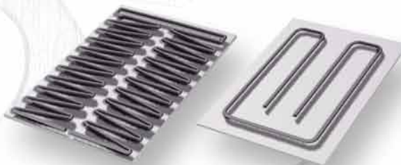
Brand X heat platen

Our exclusive SuperCoil-Microwinding™ heater technology guarantees perfect uniform heat to the edge - outperforming and out heating all others, with Lifetime Warranty!