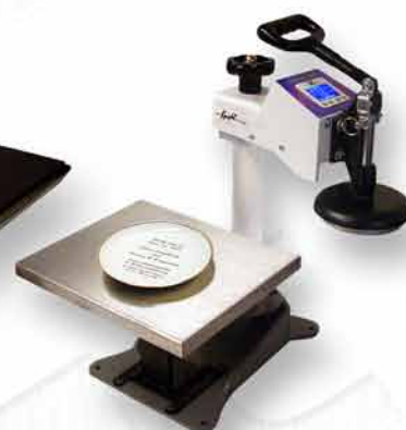
Plates / Custom