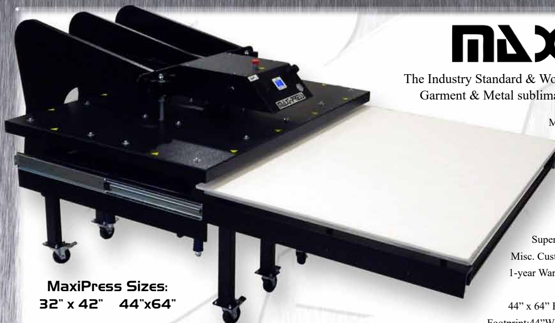
MaxiPress Sizes: 32" x 42" 44"x64"