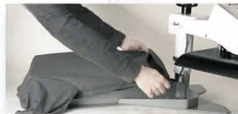
Dress / Thread from the Front (Screenprint style Quick-load)

ALL-Thread™ bottom tables allow for dressing garments, bags, and other hard-to-press bulky products around the table. Instantly interchangeable sleeve, youth, bag platens, & custom sizes are available!